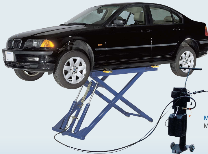
MR6K-48 Mid-rise lift

Mid-rise models lift cars, vans and light-duty trucks. They are ideal for tire, wheel and brake related repairs, collision repair work and new car preparation.