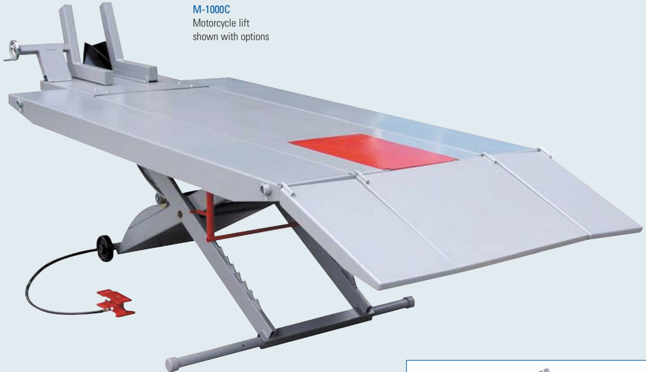
M-1000C Motorcycle lift shown with options

This air powered lift table is ideal for making repairs to motorcycles, snowmobiles, ATVs, jet skis, etc. The 1,000 lb. capacity, extra large platform brings all your jobs to a comfortable 30" working height. Choose from a range of accessories to customize this table for your shop.